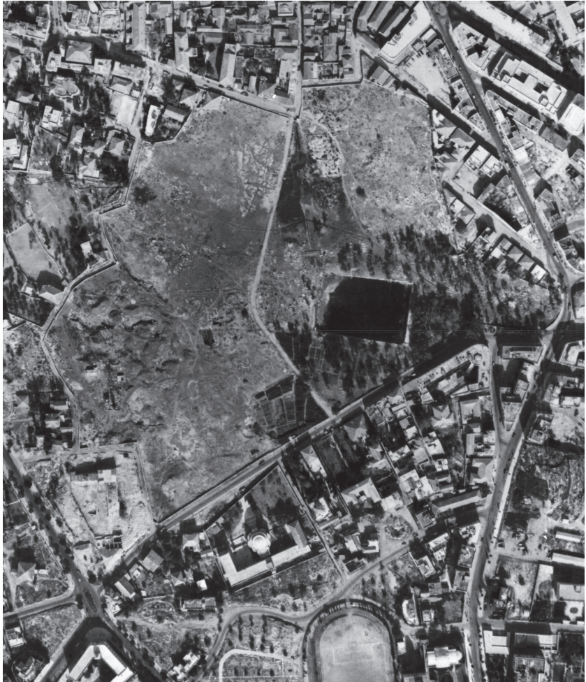
A. 1951 aerial photograph of Mamilla Cemetery showing the entire cemetery intact, without any development on it.