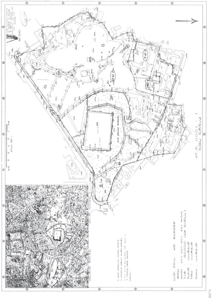
D. 2006 map showing the Mamilla Cemetery divided into various plots, including 158, constituting Independence Park, 131 and 132, where a school and playing field have been erected, 139, where an underground parking lot and other structures have been constructed, and the unmarked area just south of plot 139, where the boundaries of the Museum construction site are highlighted. The eastern portion is marked “Muslim Cemetery,” which is what remains visible of the ancient cemetery and its historical structures, including the Mamilla pool in the center.